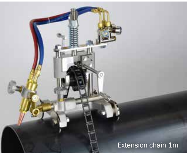
Extension chain 1m

The Picle-1 is a manually operated pipe cutting machine for cutting and bevelling pipes. Equipped with a chain and worm gear drive system with low transmission ratio, leading to an absolutely frictionless feel.